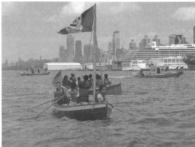
Midtown Manhattan on the Hudson, under the watchful eye of the Coast Guard. It's a very congested, and occasionally contested, stretch of New York City waterfront.

The next break was kindly provided by Floating the Apple (see related story on page 11), a non-profit organization and TSCA chapter that builds 26' Whitehall Rowing Gigs at its Pier 84 Community Boathouse and makes them available for free use. A great facility, which they generously allowed us to share for a lunch break. One concerned member commented to one of the RTB students: "You're rowing around Manhattan!?"