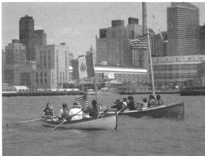
The best view of Manhattan that can be had — from the water, shared with friends, in boats you built yourself.

Back on the water the current was still moving rapidly and boats of every shape and size were going every direction as we approached Battery Park. Sailboats, powerboats, kayaks, water taxis, tour boats, ferries, container ships, and tugs with barges, all in view. The water conditions continued rough from wind and wakes, made the rowing difficult, and the frustration coupled with one or two cases of possible flu and