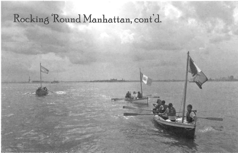
Homeward bound. Traversing Upper New York Harbor with the Statue of Liberty and Ellis Island in the background. Left-to-right: Triumph , Aurora and Eden .

arrived at Spuyten Duyvil, the joining of the Harlem and Hudson Rivers at the northern tip of Manhattan.