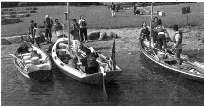
Loading the boats at Hunts Point Riverside Park. Eighteen crew in four boats, loaded and ready to depart on time. Remarkable.

Saturday morning at 8:00am a remarkably jovial co-ed group stuffed drybags, counted sleeping pads, loaded coolers, distributed water, and chose their rowing partners and boats. By 9:30 the loaded boats were on the water under warm and sunny skies, with nervous parents watching from the dock. After setting the masts and banners for visibility, the