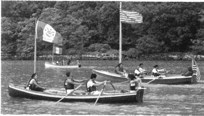
Sunday morning on the Hudson River, southbound along the verdant shoreline of the New Jersey Palisades.

boats were shoved off, oars unshipped, and away we went, 18 of us in four boats. The launch time into the Bronx River had been set to take advantage of the flood tide up the East River several hours later. Technically a tidal strait connecting the Upper New York Bay to Long Island Sound, the water moves like a river in opposite directions depending on the tide.