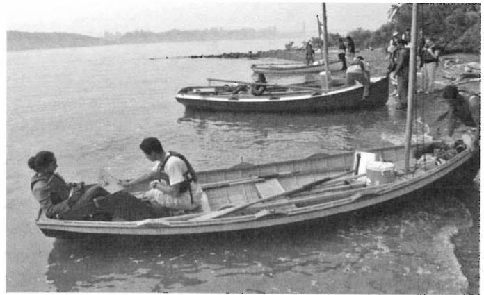
Final preparations before launch on Sunday morning. Rowers take advantage of last-minute standing, before a full day of seated pulling.

Four hours into the trip a rhythm had developed and all was good as we steadily made our way NNW up the