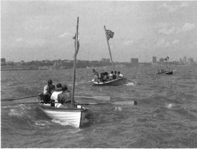
Rocking and rolling on the Hudson River. A combination of current, wind, and wakes provided the action.

Where are your gloves?" The South Bronx teenager showed his callused hands and replied, "These are my gloves." Shared interest, different approach.